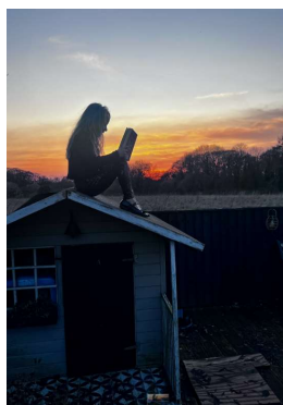
Olivia Barn Owls