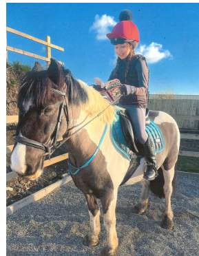
Darcey Snowy Owls